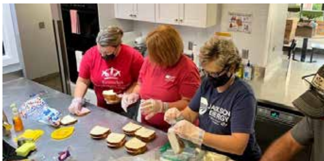
Employees from Kentucky's Touchstone Energy Cooperatives deliver donations and help with lunch for the guests at the Ronald McDonald House in Lexington.