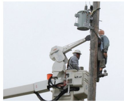
Jackson Energy lineworkers participate in the annual Safety Day where they advance their skills in hurt man rescue.

We appreciate our lineworkers' hard work in bringing power to your home, regardless of the time of day or night, and despite the weather conditions-and their dedication to doing so safely.