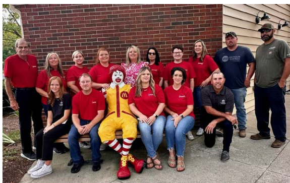
Employees from several cooperatives volunteered to deliver Wish List items to the Ronald McDonald House Charities of the Bluegrass location in Lexington.