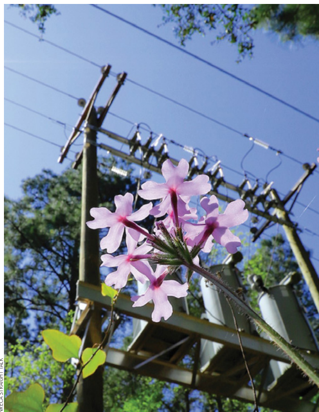
MRECA STRAIGHT TALK

Although it may seem counterintuitive, we also maintain power reliability through planned, controlled outages. By carefully cutting power to one part of our local area for a few hours, Jackson Energy can perform system repairs and upgrades, which ultimately improve electric service. Planned outages can also be used to balance energy demand, but only in rare circumstances.